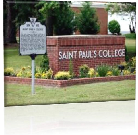
Souvenir Booklet Ad